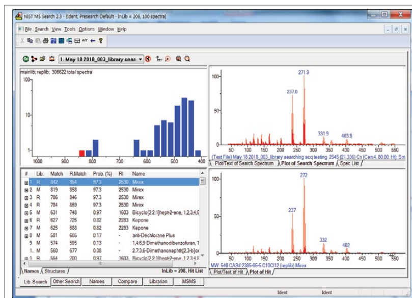
Figure 2. NIST library search results for mirex.