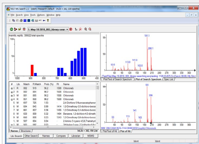
Figure 1. NIST library search results for chloroneb.