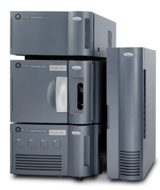
Figure 1. ACQUITY Arc UHPLC System.

ACQUITY Arc UHPLC System (Path 2) with active solvent preheating (CH-30A) and 2998 PDA Detector