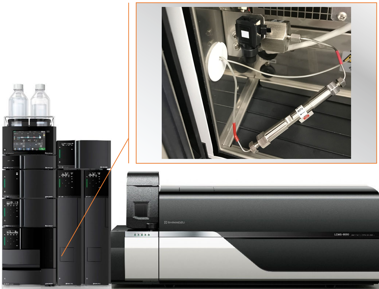
Figure 2: Installation of delay column

Another common practice for the trace analysis of PFAS has been to modify the standard vial and cap selection most commonly used by laboratories. The use of polypropylene vials and enclosures is common, however, polypropylene caps have the disadvantage of not resealing after injection, thus risking compromise to sample integrity.