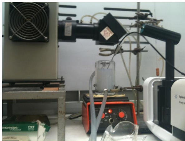
Figure 1. The Cary 60 UV-Vis fitted with the fiber optics microprobe accessory provides a simple mechanism to measure a sample in situ and remote to the instrument

high-intensity UV light to induce photochemical reaction, being stirred continuously during the analysis, and the absorbance measured at 20 °C using a fiber optic microprobe.