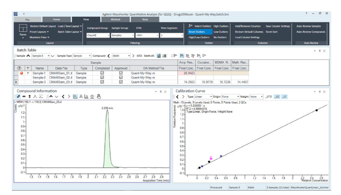
Updated and Streamlined User Interface

As part of Quant-My-Way, the user interface has been updated and streamlined. Of course, MassHunter Quantitative Analysis will continue to contain all the features you already know and love.