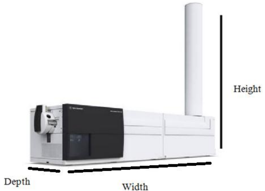
Figure 3 G6560A Ion Mobility Q-TOF LC/MS System