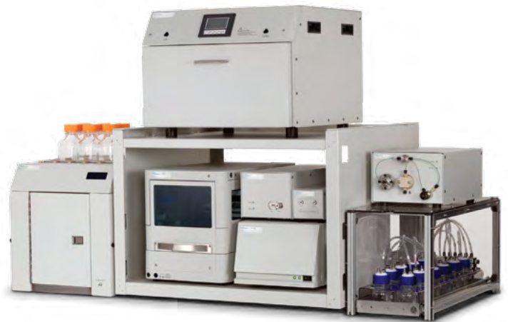
SFC PREP Investigator System.