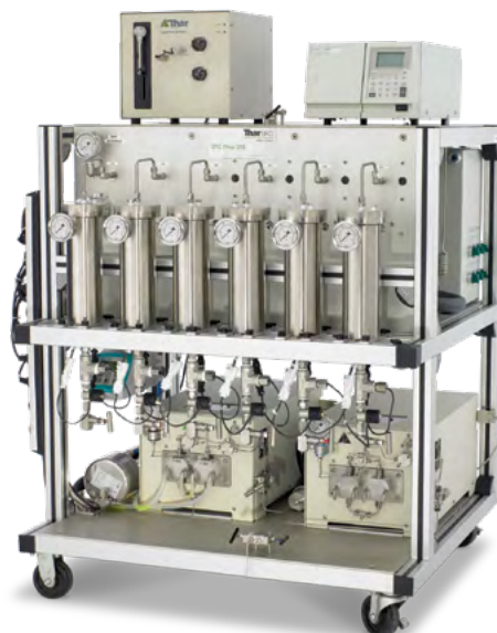
SFC Prep 350 System.