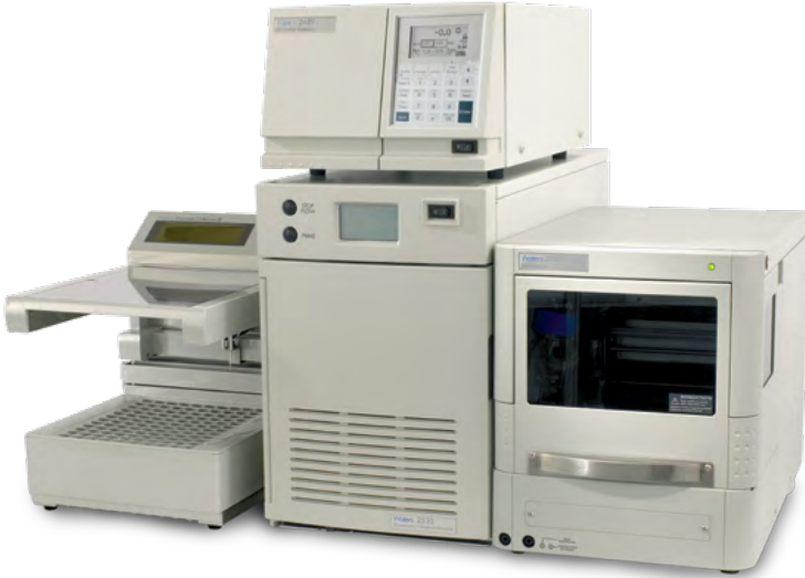
Purification System featuring Waters 2545 Quaternary Gradient Module, 2489 UV/Vis Detector, WFCIII, and 2707 Autosampler.