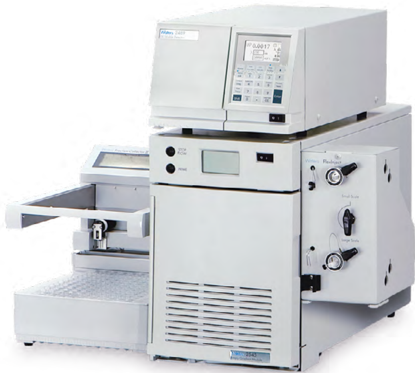
Purification System with FlexInject module.