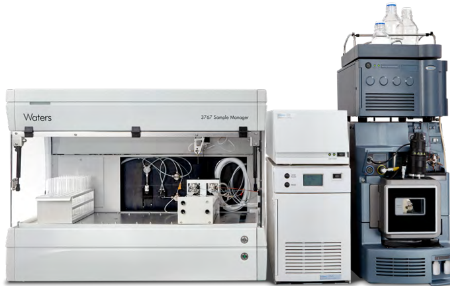
AutoPurification Mass-Directed HPLC System.