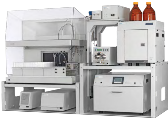
SFC Prep 15 System with ACQUITY QDa Detector.