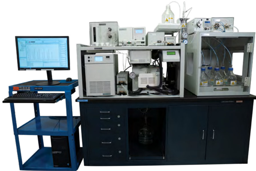
SFC Prep 150 Mgm System.