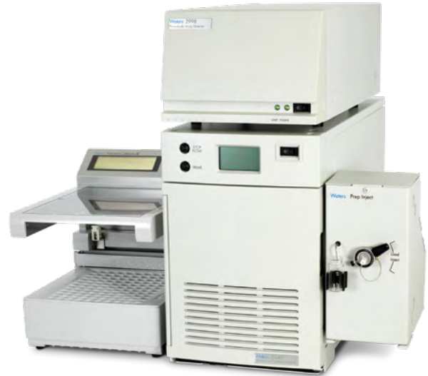
LC Prep 150 System featuring 2545 Binary Gradient Manager, 2998 PDA Detector, Prep Injector Module, and WFC III.