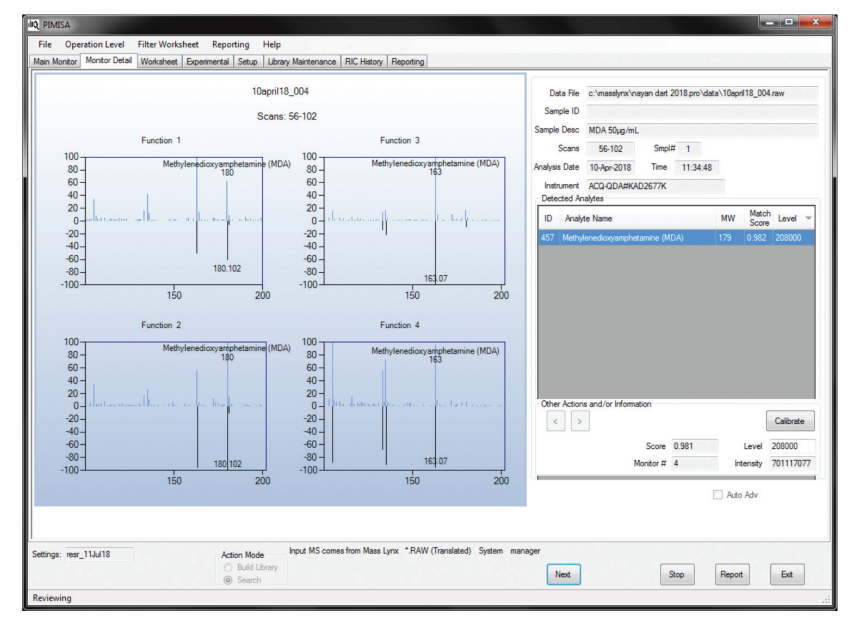
Figure 3. Spectral matching of 4 cone voltages (Functions 1–4) of the acquired data (upper trace) to the supplied library spectra (lower trace) for MDA.