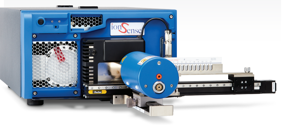
Figure 1. The DART QDa System with the QuickStrip holder.

The DART QDa System can be used as an ultra-fast screening technique for seized material.