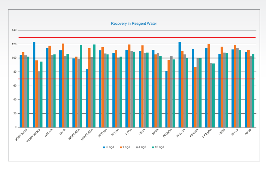
Figure 1. Recovery of EPA 537.1 PFAS in reagent water. All compounds are well within the method recovery guidance of 70–130%.

The Sep-Pak PS2 Cartridge (p/n: WAT200610) is a direct equivalent to the chemistry mandated in the 537.1 method and meets all the necessary analytical requirements.