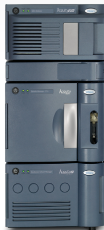
Figure 1. ACQUITY UPLC H-Class PLUS System and ACQUITY QDa Mass Detector.

In the second of a two-part series, we present a simple solid-phase extraction (SPE) protocol for the preparation of compounds in biological matrices and its use with the Waters STA screening method and the ACQUITY QDa Mass Detector.