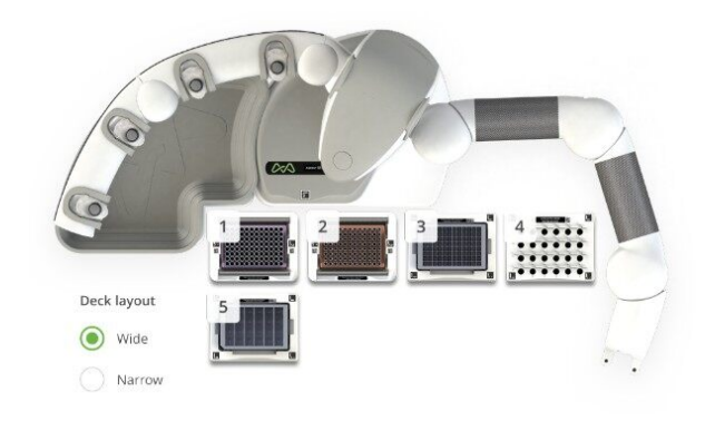
Figure 1. Andrew+ Deck layout for sample preparation of EtG and EtS in human urine using Andrew+ Microplate Shaker+.