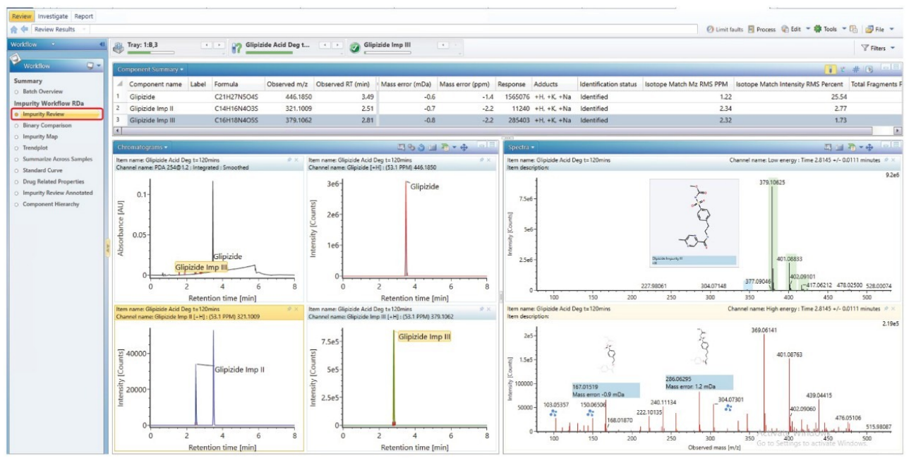
Figure 4. Low and high energy channels of glipizide Impurity III. Also shown are UV trace at 254 nm, and XIC's for API, impurity II and impurity III.