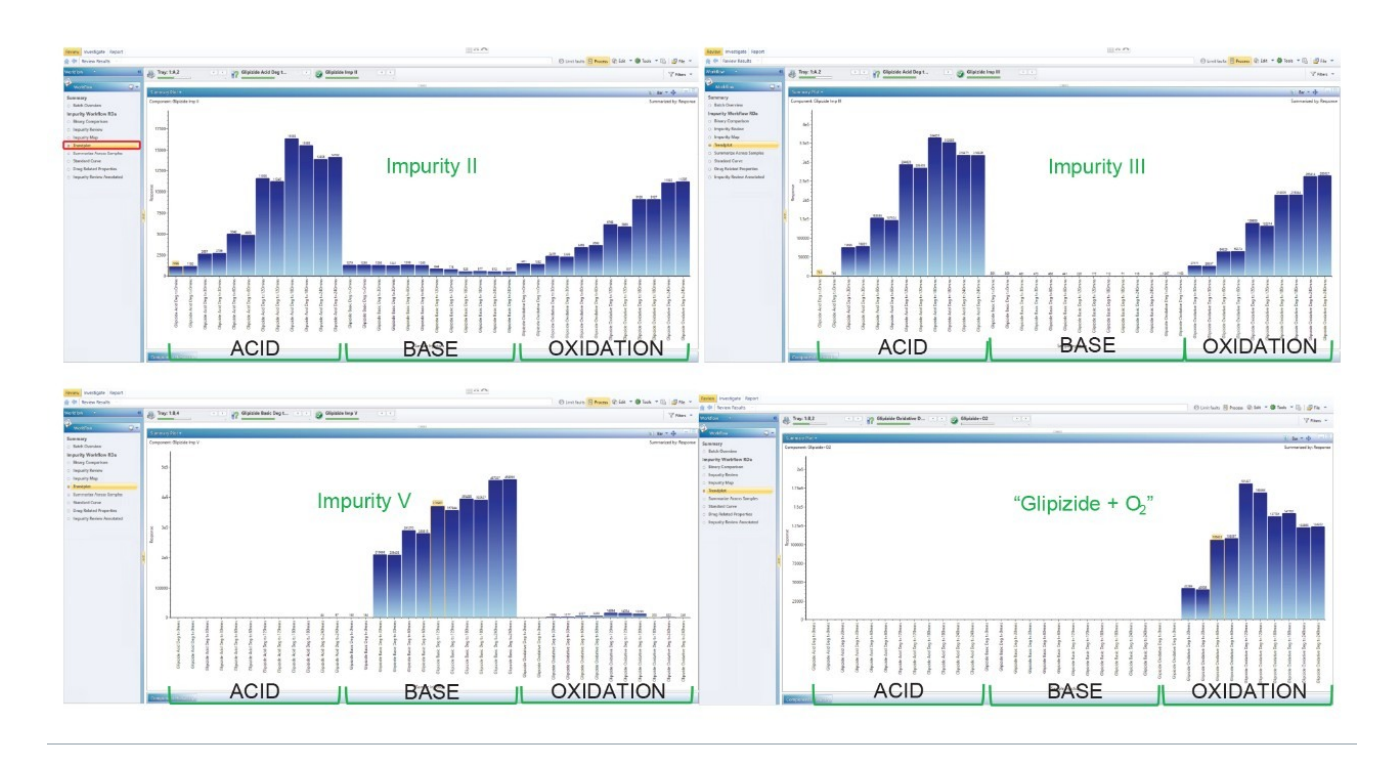
Figure 6. Trend plots across all chemical stressing conditions. Impurity II (top left), Impurity III (top right), Impurity V (bottom left), and the oxidation product at m/z 478.1751, (bottom right).