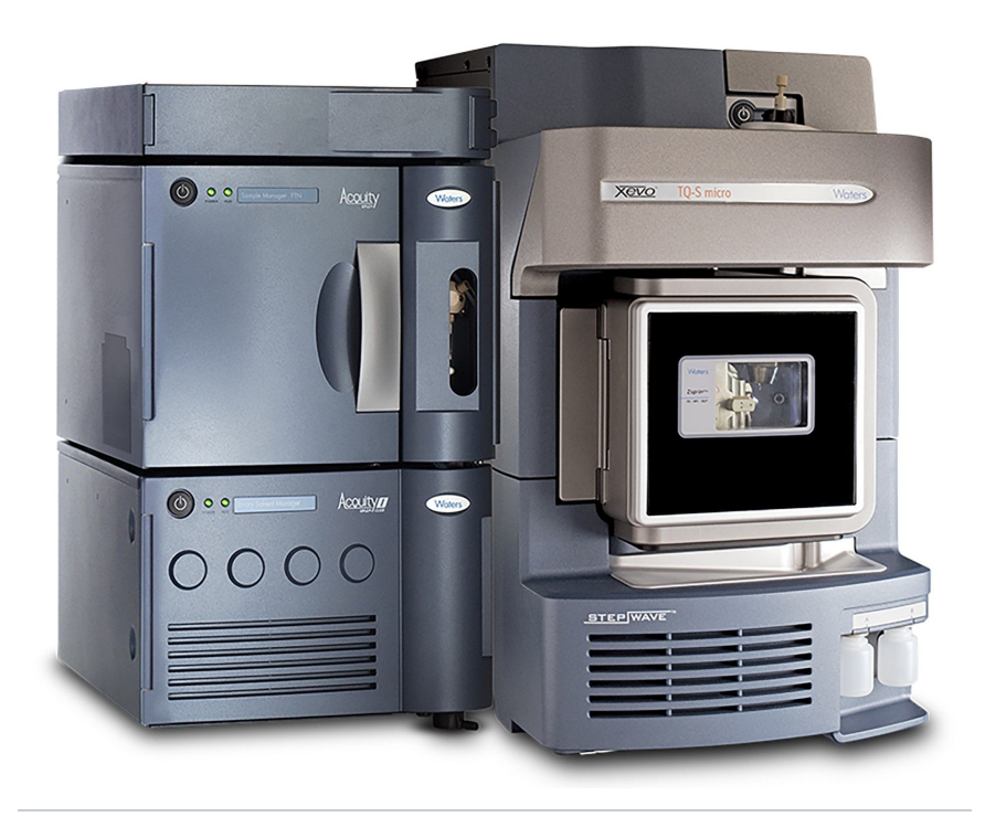
Figure 1. The Waters ACQUITY UPLC I-Class with FL System and Xevo TQ-S micro Mass Spectrometer.

Here we describe a clinical research method using a simple and fast protein precipitation of a small volume of human whole blood. Chromatographic elution using a Waters<sup>™</sup> ACQUITY<sup>™</sup> UPLC<sup>™</sup> HSS C<sub>18</sub> SB Column on a Waters ACQUITY UPLC I-Class with FL System was completed within 1.5 minutes. Simultaneous analysis of all four analytes, followed by detection on a Xevo<sup>™</sup> TQ-S micro Mass Spectrometer (Figure 1) was achieved with a time of under two minutes from injection-to-injection.