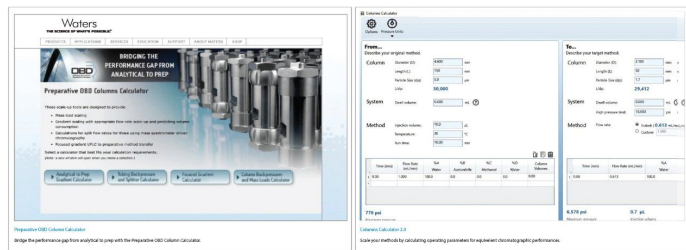
Figure 2. Waters Preparative OBD Column Calculator and the Columns calculator 2.0 online adjustment calculators ( www.waters.com ).

The monograph system suitability impurities mixture (SST) was analyzed with the adjusted gradient and modernized chromatographic hardware. For all modern column dimensions, the monograph system suitability resolution requirement of NLT 1.5 for the unresolved, abacavir critical pair was successfully achieved (Figure 3). When the SST relative retention times (RRTs) were compared to those generated with the stationary phase utilized for the initial monograph separation, they were most similar for columns of the same L1 stationary phase substituents, while RRTs varied with different L1 stationary phase substituents (Figure 4). As noted in USP <621>, peak deletions and/or inversions, may be observed using various substituents, therefore chromatographic peak identity was confirmed after method adjustment by PDA spectral analysis.