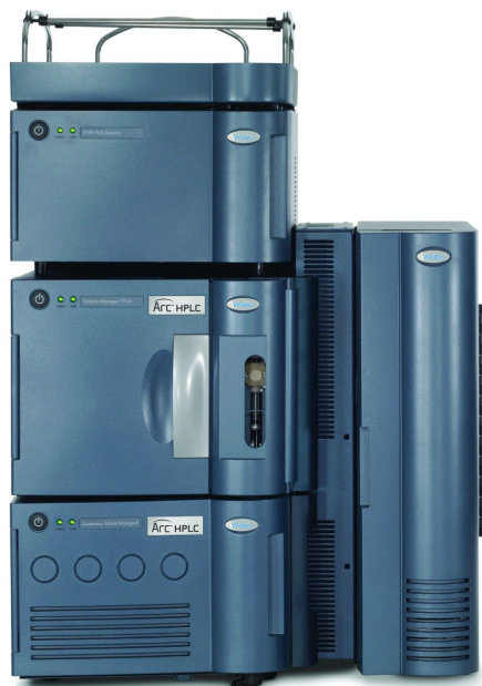
Figure 1. Arc HPLC System with PDA Detector.

a comparable separation in less time, and with less solvent consumption. Modern HPLC systems, such as the Arc HPLC System (Figure 1), extended HPLC operating backpressure limits, provide dependable flexibility when adjusting monograph methods to suit modern column hardware dimensions.