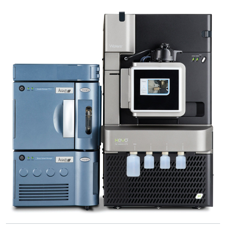
Figure 1. Waters ACQUITY™ Premier UPLC I-Class System with Xevo™ TQ Absolute Mass Spectrometer.