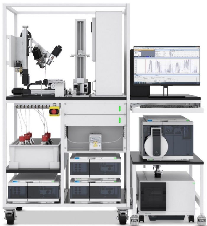
Figure 1 RapidFire 400 System with Cooling