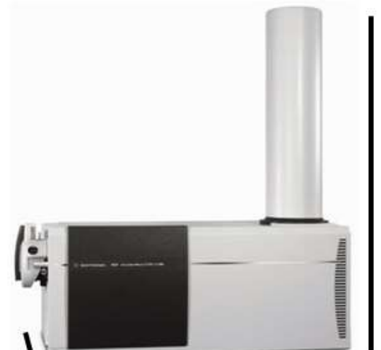
Figure 1 G6530 Accurate-Mass Q-TOF LC/MS System