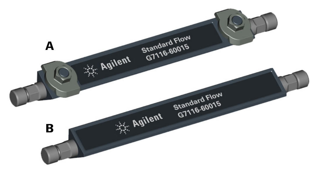
Figure 1 Quick Connect Heat Exchangers of the old design (top, A) and new design (bottom, B)

New design Quick Connect Heat Exchangers do not have twist lock clips on the front side of the heat exchanger. Instead, Quick Connect Heat Exchangers include two column holders to fix the heat exchanger in the MCT heater block. For details, see Figure 1 on page 1.