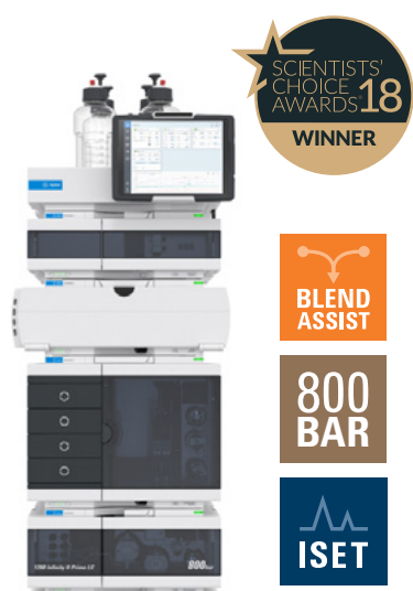
Figure 1. The 1260 Infinity II LC has received the 2018 Scientists' Choice Award for Best New Separations Product.

This white paper illustrates how the new capabilities of the 1260 Infinity II Prime LC can sum up to over 80,000 USD of incremental economic value per year compared to a conventional LC system. This economic value includes the following aspects: 1) reduced cost of operation; 2) reduced downtime; 3) more samples per day; and 4) the utilization of one system for many methods. This white paper can serve as a resource for lab managers while calculating the financial benefit of replacing their current instrumentation with the 1260 Infinity II Prime LC.