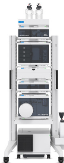
Figure 5. Agilent InfinityLab LC/MSD iQ with the 1260 Infinity II Prime LC in the InfinityLab Flex Bench MS.

The compact and intuitive InfinityLab LC/MSD iQ is the perfect partner for labs performing small molecule analysis in pharmaceutical drug discovery, development, and QA/QC labs as well as academia, food, and chemical/materials labs that need mass spectral information for making data-driven decisions. Unlike other complicated and costly LC/MS and LC/MS/MS systems that require extensive MS knowledge, the InfinityLab LC/MSD iQ is specifically designed for chemists, chromatographers, and new users looking for more throughput and improved financials in their lab operation.