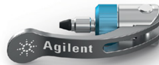
Figure 2. Agilent InfinityLab Quick Connect fitting.

An incorrectly installed column can lead to peak tailing, peak broadening, split peaks, and carryover. Sometimes, faulty connections can also cause damage to the column. InfinityLab Quick Connect and Quick Turn fittings (Figure 2) simplify installation, ensuring a dead-volume-free column connection up to 1300 bar. These fittings reduce the failure rate during column exchange and decrease associated costs caused by destroyed columns.