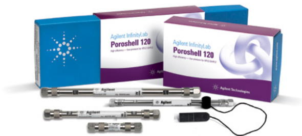
Figure 6. InfinityLab Poroshell 120 columns.

Superficially porous particle (SPP) LC columns can generate high efficiency at lower pressure, relative to their totally porous particle (TPP) column counterparts. The higher efficiency can be used to speed up analyses or improve results—giving better resolution and sensitivity.