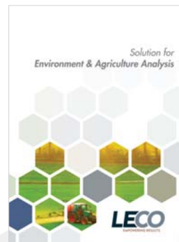
Environment & Agriculture 209-205-005