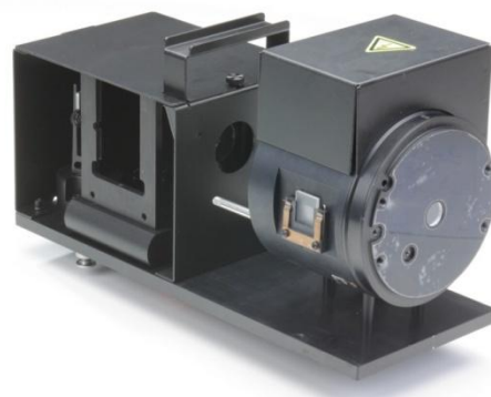
The Internal Diffuse Reflectance Accessory