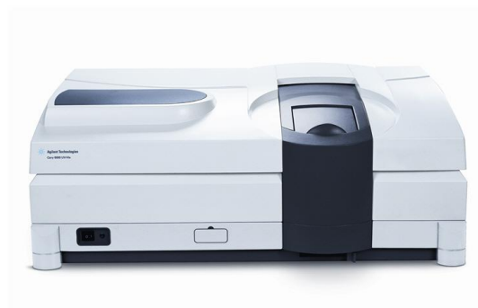
Cary 4000, 5000 and 6000i instruments provide excellent photometric accuracy

Photometric accuracy is part of the standard test required by many regulatory bodies including the Pharmacopoeias, and is typically performed on the spectrophotometer. When using accessories such as diffuse reflectance accessories (DRAs) which have in-built detectors, it is important to determine the photometric accuracy of the whole system. This test uses a standard potassium dichromate solution to demonstrate the photometric accuracy of the New Generation Cary 4000/5000/6000i spectrophotometers with the Agilent DRA.