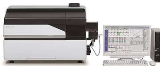
Figure 1: ICPMS-2030

nitric acid and 3 mL of hydrogen peroxide was added into each vessel. Closed-vessel microwave digestion was used to minimize the potential loss of volatile analytes. The digestion program is listed in Table 1. After digestion, the digestate was transferred into a polyethylene (PE) tube and topped up to 40 mL with ultrapure water. All digested sample solution was further diluted by 5 times before ICP-MS analysis, giving a total dilution factor (DF) of 20. For Apple and Yuzu juices, total digestion with clear digested sample solutions could be achieved. While for Mango and Guava juices, the digested sample solutions were left to stand for 15 minutes to allow the white residue to settle before further dilution.