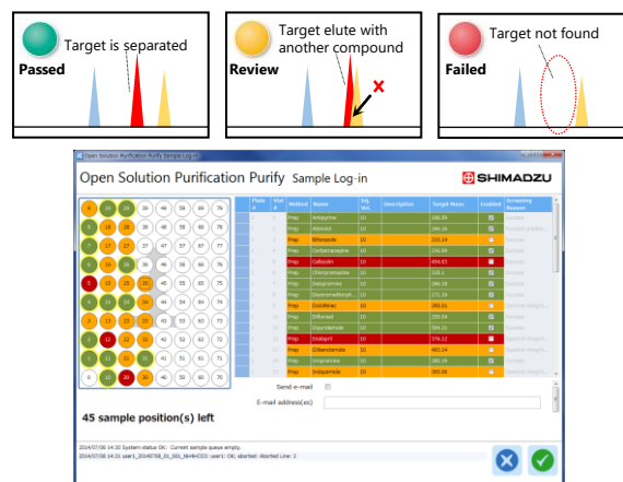
Fig. 2 Open Solution classify crude compounds to three situations

Typical screening steps require manual checking for each crude sample. Open Solution™ is an open-access software that assists the whole drug discovery workflow from screening to purification. The software automatically classifies crude samples into three situations using target m/z information and MS spectrometry (Fig. 2).