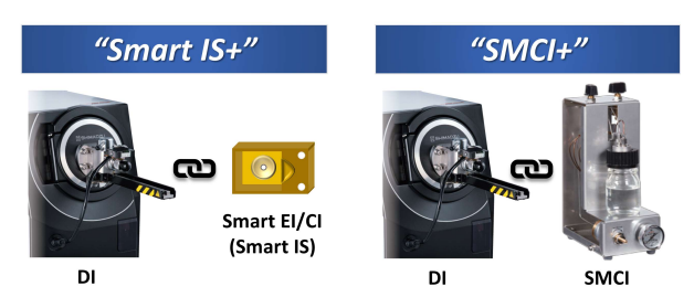
Fig. 1 Polymode Ionization setup inclusive of "Smart IS+" and "SMCI+".

The DI probe is designed to be able to fit a miniature sample vial at its tip. The sample vial is thereafter placed close to the ion source and subsequently heated up according to a temperature program. The chemicals in the sample vial are hence volatilized and ionized in the ion source.