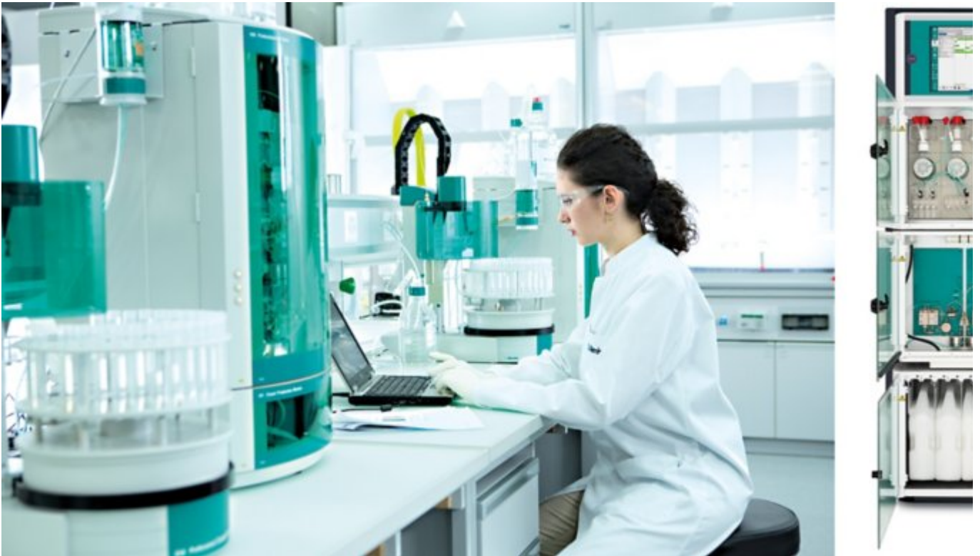
Figure 2. Ion chromatographs for laboratories (left) and for process analytics (right).