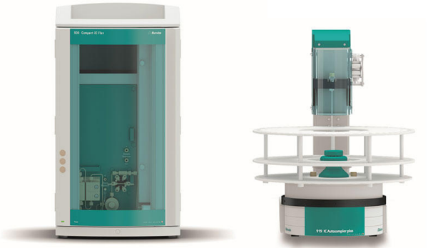
Figure 1. Instrumental setup including a 930 Compact IC Flex Oven/Deg and a 919 IC Autosampler plus.

Samples are directly injected into the IC with a 919 IC Autosampler plus (Figure 1). Cations are separated using a Metrosep C 6 -150/4.0 column (L76) and detected with non-suppressed conductivity (Table 1). The run time was 40 minutes which complies with the USP requirements of 1.5 times the retention time of the calcium peak (here: 24 minutes). A one-point calibration with the standard solution of 0.08 mg/mL of USP Calcium Acetate was used for quantification. Samples were evaluated as triplicates. Repeatability studies are done with 6-fold injections.