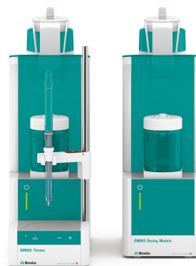
Figure 1. OMNIS Advanced Titrator and OMNIS Dosing Module equipped with Na-ISE for the determination of sodium.

To a reasonable amount of sample, either ISA solution consisting of c(\text{CaCl}_2) = 1 \text{ mol/L} is automatically added and the potential is measured, or the standard addition is carried out with the sodium standard solution \beta(\text{Na}^+) = 2000 \text{ mg/L} .