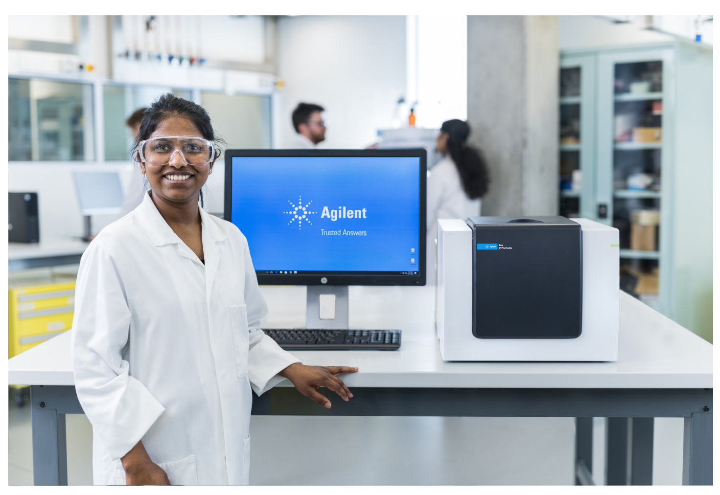
Figure 1. The Agilent Cary 3500 Flexible UV-Vis spectrophotometer includes a large sample compartment and can be fitted with multiple accessories, making it ideal for the characterization of solid samples.