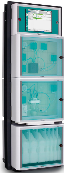
Figure 2. 2060 TI Process Analyzer for the online analysis of critical quality parameters in pickling baths using the method of titration.

over a wide concentration range—the 2060 TI Process Analyzer (Figure 2).