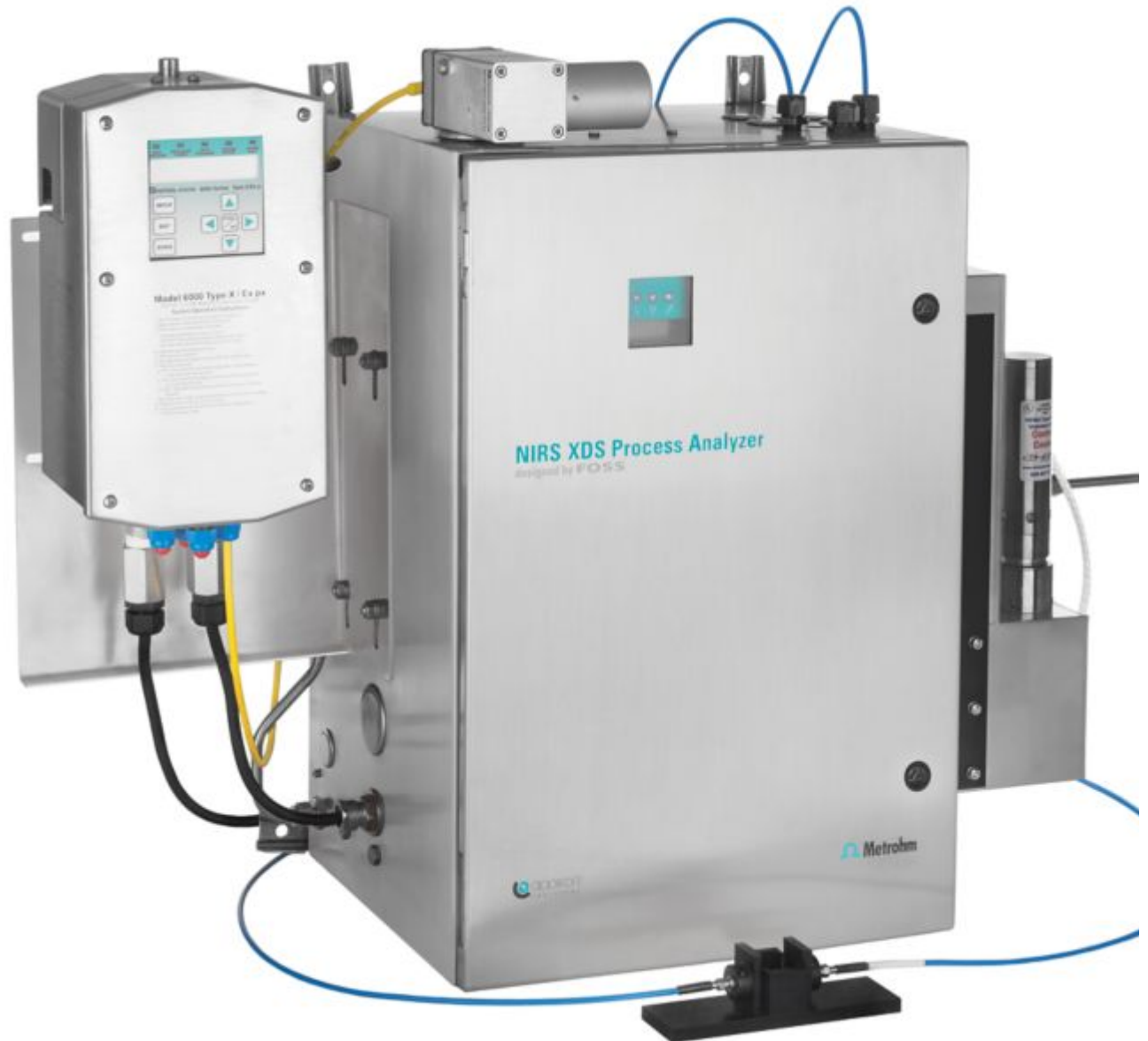
Figure 3. The NIRS XDS Process Analyzer – MicroBundle from Metrohm Process Analytics.

After samples are preconditioned, NIRS measurements are performed in a flow-through cell. The instruments used in refineries are certified as ATEX or Class 1 Div 1/2. They are either mounted in the plant where they will require positive air pressure, or in a pressurized shelter. The distance between the instrument or shelter and the sample points can be hundreds of meters apart. Every 30 seconds, RON and MON values are transmitted to the programmable logic controller (PLC) or distributed control system (DCS) depending on the communication protocol used.