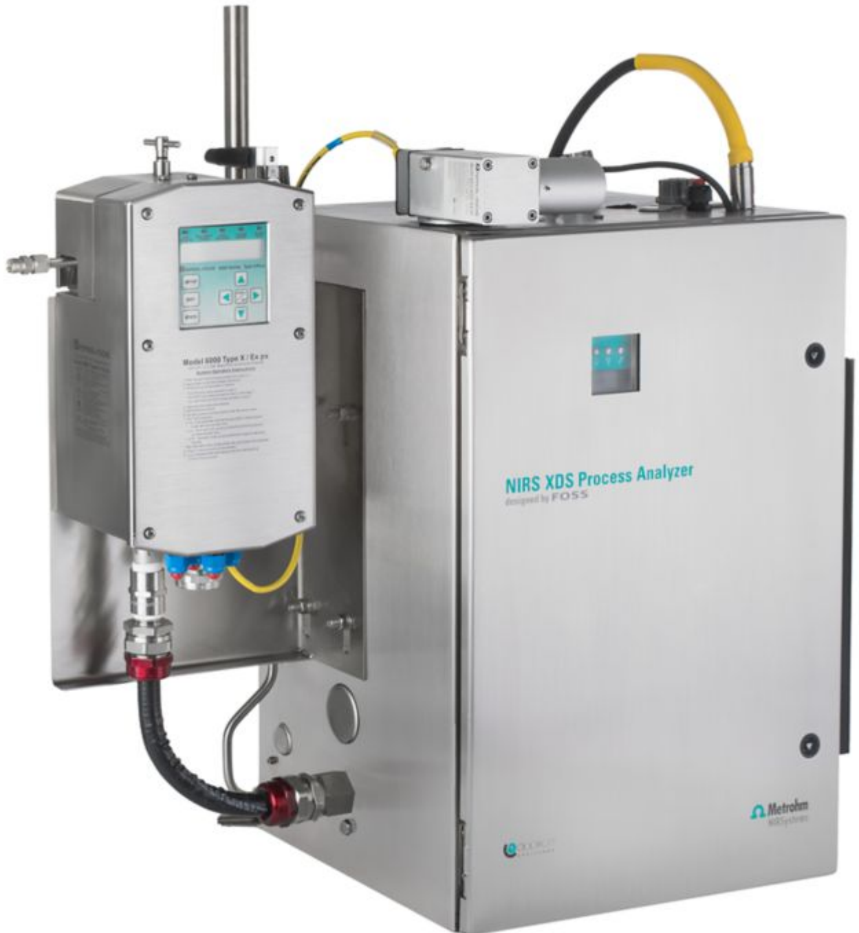
Figure 3. NIRS XDS Process Analyzer

Measurements can be performed directly inline thanks a dedicated immersion probe coupled to microbundle fibers. Such a combination allows the NIR measurement of samples with suspended solids and the presence of bubbles, without requiring filter screens around the