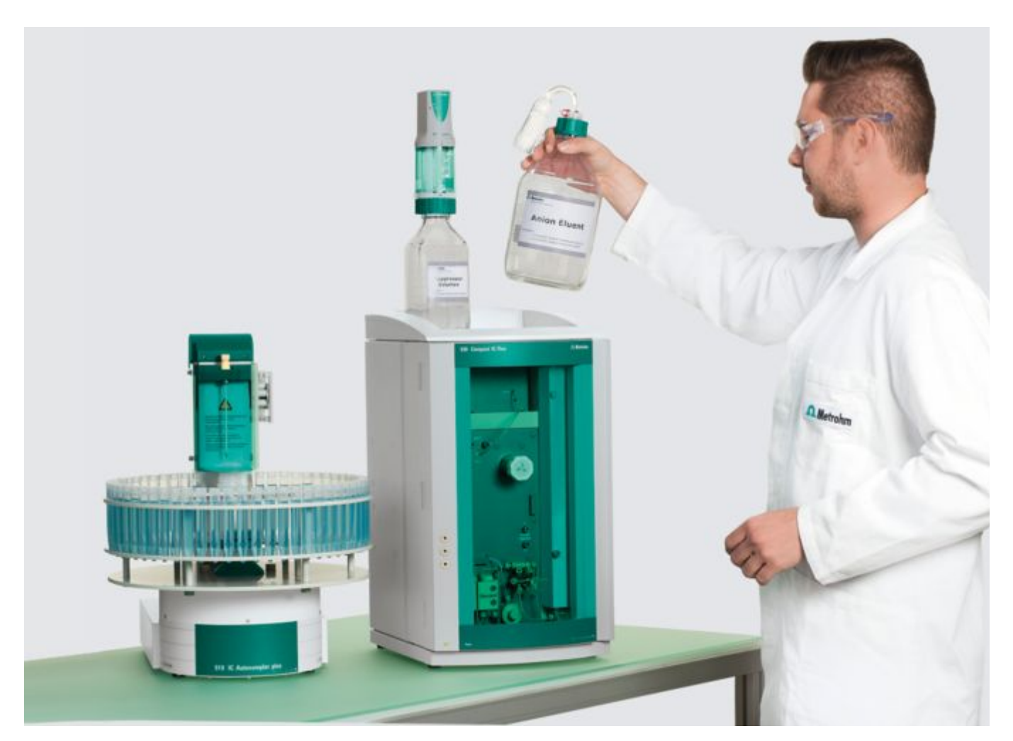
Figure 1. Compact, user-friendly Metrohm IC instrumentation to quantify various anions in explosives and explosion residues.

Artificial samples were dissolved in 10% methanol and automatically filtered using Inline Ultrafiltration. The Metrohm intelligent Partial Loop Injection Technique (MiPT) allows the injection of a precise variable volume depending on the sample load, and an automatic calibration.