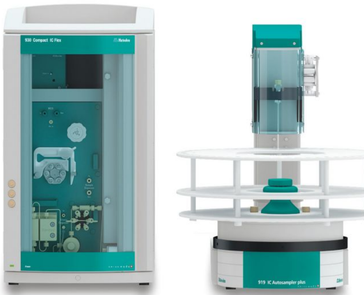
Figure 1 Instrumental setup including a 930 Compact IC Flex with IC Conductivity Detector (L) and the 919 IC Autosampler plus (R).

The samples were injected directly into the ion chromatograph ( Figure 1 ) and analyzed using the method parameters given in the respective USP monograph ( Table 1 ).