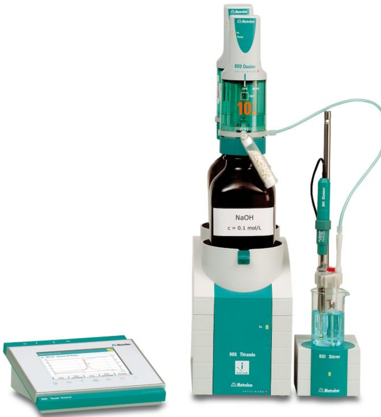
Figure 1. Example of a Titrande system consisting of a 905 Titrande and a 900 Touch Control. Alternatively the 905 Titrande can also be connected to a PC and controlled by tiamo.

The analysis is performed automatically on a Titrande system consisting of a 905 Titrande. The Unitrode is used for the indication of the titration curve.