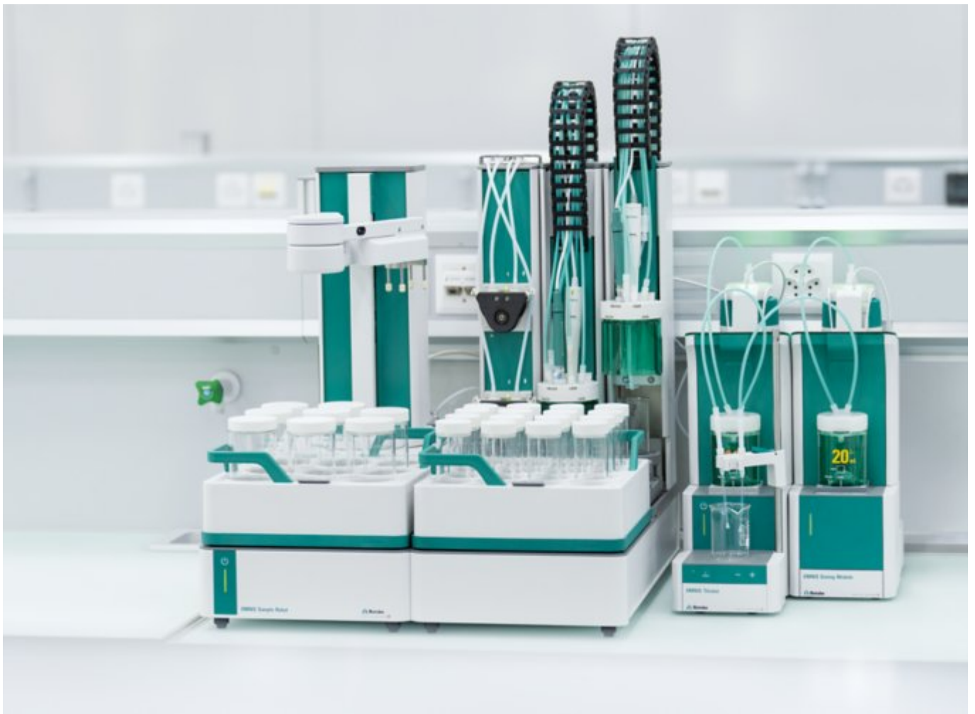
Figure 1. OMNIS Sample Robot S equipped with an OMNIS Titrator, Dosing module, and dUnitrode electrode for the automated determination of pyrophosphate in aqueous samples.