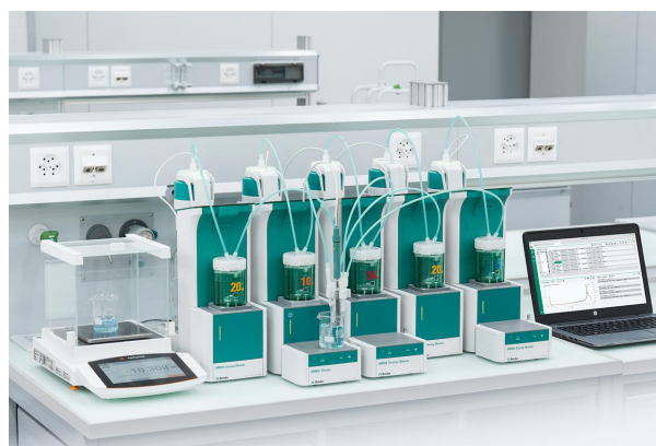
Figure 1. When equipped with an Optrode M2, the OMNIS Professional Titrator with OMNIS Dosing Modules (shown here) is an ideal setup for rare earth metal determination.

An appropriate amount of sample is weighed into the titration beaker, and acetate buffer as well as xylenol orange indicator solution are added. The solution is titrated until after the first equivalence point with standardized EDTA solution.