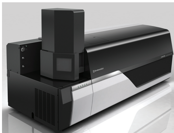
Fig. 1 DPiMS™-8060