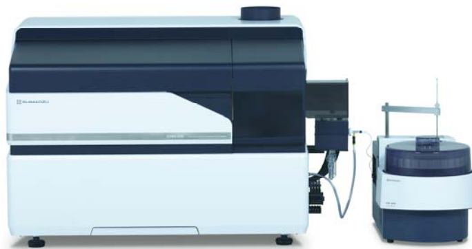
Figure 1. ICPMS-2030 Inductively coupled plasma mass spectrometer with AS-10.

A Shimadzu ICPMS-2030 coupled with auto sampler AS-10 (Figure 1) was used for analysis of measuring elements in tea and coffee matrix. The detailed instrument configurations and operating parameters are summarized in Table 4.