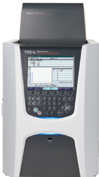
Figure 1: Shimadzu TOC-L with TN Module