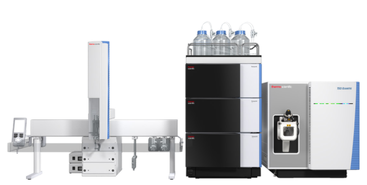
The Thermo Scientific™ Transcend™ TLX-1 UHPLC System incorporates the benefits of Turboflow Sample Preparation Technology.