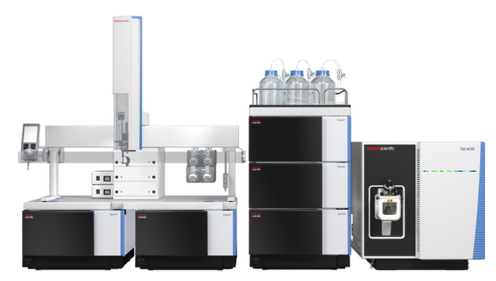
The Thermo Scientific™ Transcend™ TLX-2 UHPLC System—doubles throughput compared to a single LC system and incorporates the benefits of Turboflow Sample Preparation Technology.