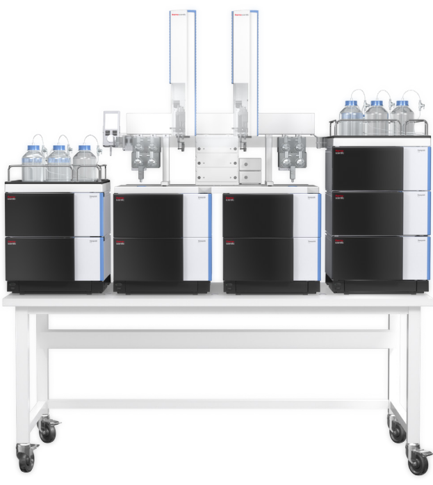
The Thermo Scientific™ Transcend™ TLX-4 UHPLC System—maximum throughput enabling four times the throughput of a single LC system with the additional benefits of Turboflow Sample Preparation Technology.